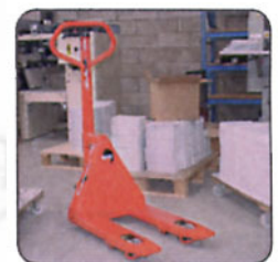
Panther is available with different fork lengths