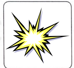
The pallet truck is also available in an explosion proof