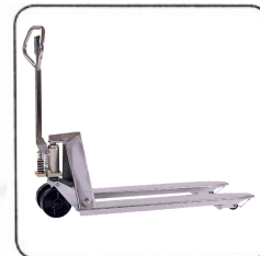
GL2000 is available with different fork