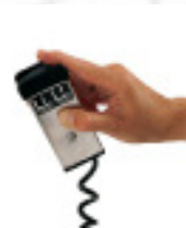
Remote control is available as optional extra (RHLE)