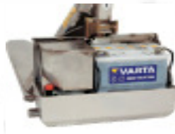
Watertight casing of the lifting motor (RHLE SS-PLUS)