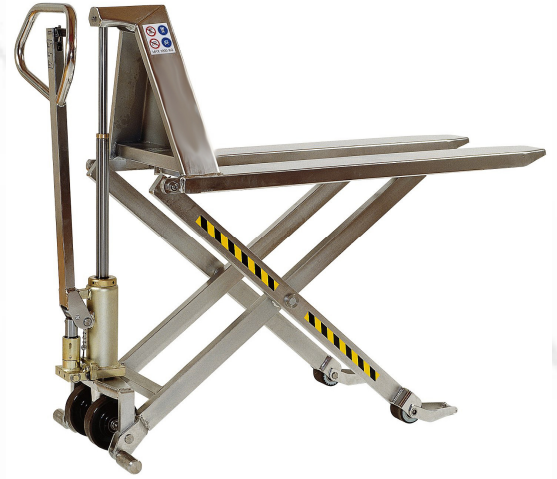
The manual highlifter is also available in an explosion proof version (RHLEXP)