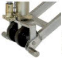
Optimum safety through supporting feet at steering wheel and central location of all control buttons on the handle