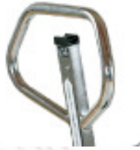
The ergonomically correct handle ensures the user a relaxed hold