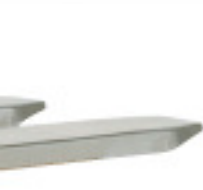
Closed forks mean easy cleaning and few hiding places for bacteria