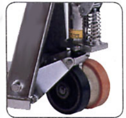
Different wheel types to suit the needs of the user