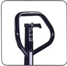
Ergonomic handle ensures the user a relaxed hold.