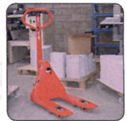
RP Compact is available with different fork lengths