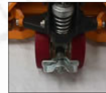
Foot Operated Parking Brake