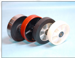
Alternative Steer Wheels