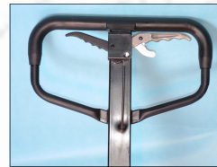
Parking Brake Handle