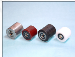
Alternative Load Rollers