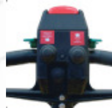
Central location of all control buttons