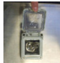
The key switch is placed in a watertight box