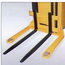
Straddle Legs FEM Class II Carriage