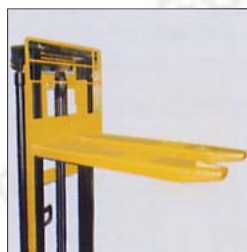
Full Freelif Masts