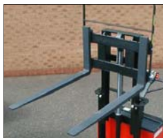
FEM Class II Carriage