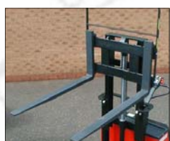
FEM Class II Carriage