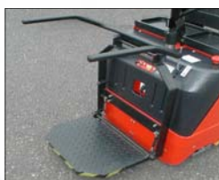
FEM Class II Carriage