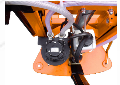
Compact Air Pump